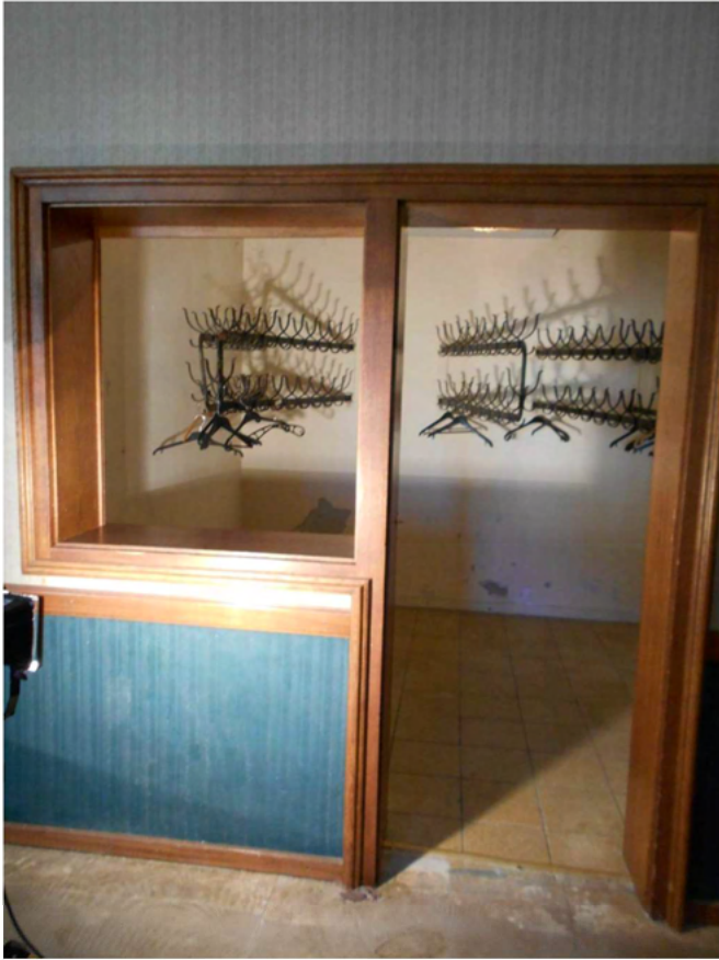
Raum 18 und 20