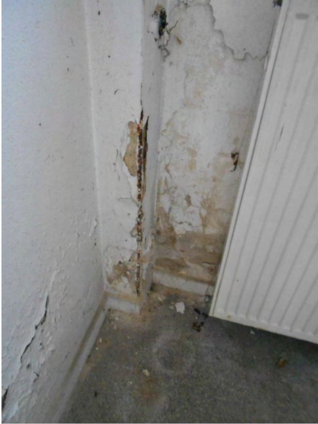
Raum 28 (Aufzug)